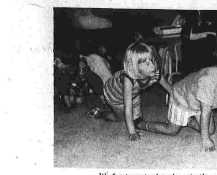
It's fun to pretend you're a turtle, especially in 90 degree temperatures.