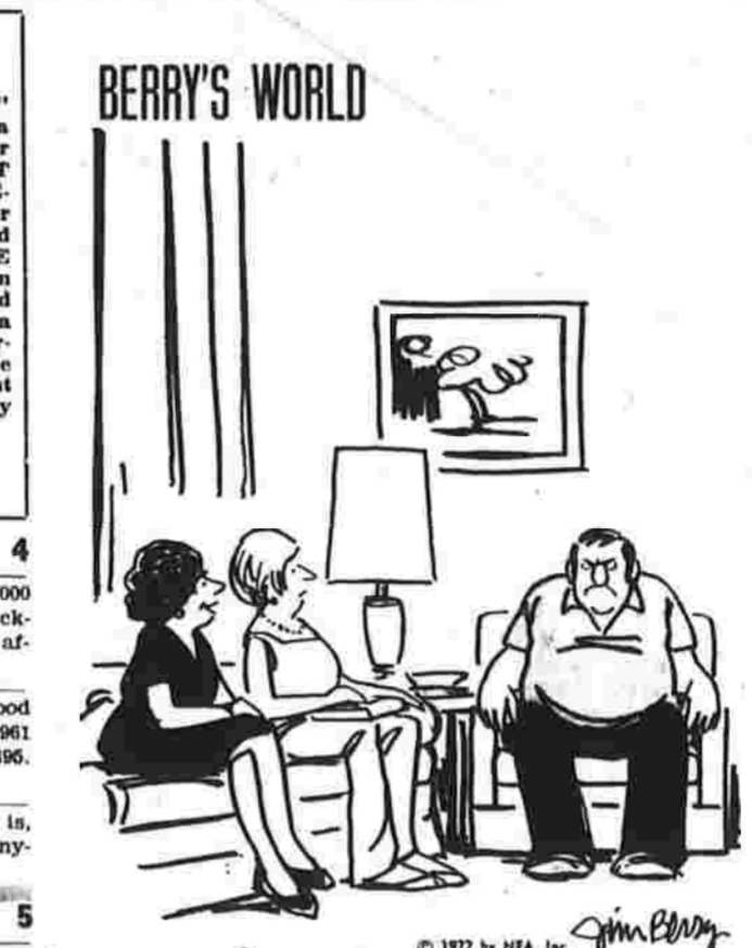
"George is in his element, now, with this being the year of 'the politics of discontent'!"

Service-Storage 10 WANTED - One-car garage